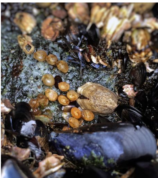
Figure 2. Nucella ostrina egg capsules.

as filamentous algae as shelter until they reach a size large enough to tolerate the more stressful exposed habitat (Fig. 1b). Nucella ostrina also make a habitat shift early in life (Gosselin 1997). Juvenile N. ostrina are exceedingly hard to find in the field but after much exploration, it appears they tend to move upwards in elevation upon hatching from egg capsules and can be found in pebble and shell substrate underneath Mytilus trossulus beds (Fig. 2). As adults, N. ostrina spend more time in exposed habitats searching for food and mates and therefore are much more commonly observed.