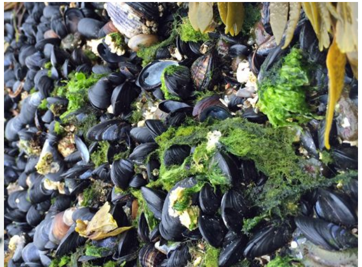
Figure 1. a: A juvenile Mytilus trossulus b: Mytilus trossulus juveniles can often be found in filamentous algae growing near adults pictured above.